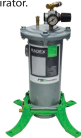
Filter located on the air dryer frame

The included Radex™ airline filter uses a 6 stage filter cartridge that removes moisture, particulates to 0.5 micron & odor from the air being sent to the respirator.